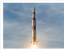
First manned spacecraft to orbit the Moon (USA) Apollo 8 December 1968