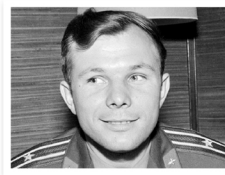
First human in space (USSR) Yuri Gagarin April 1961