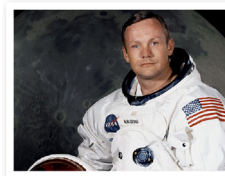
First person to step on the Moon (USA) Neil Armstrong July 1969