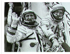
First spacewalk (USSR) Alexey Leonov March 1965