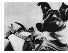
First animal in space (USSR) Laika the dog November 1957