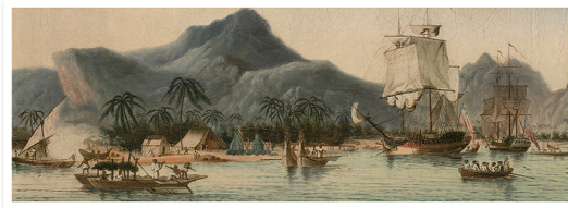
HMS Resolution and HMS Discovery

In 1776, Captain Cook went on his final voyage. He sailed on the HMS Resolution again and the HMS Discovery travelled with him. He was looking for a route between the Atlantic and Pacific Oceans. He visited the Hawaiian Islands, where he was killed.