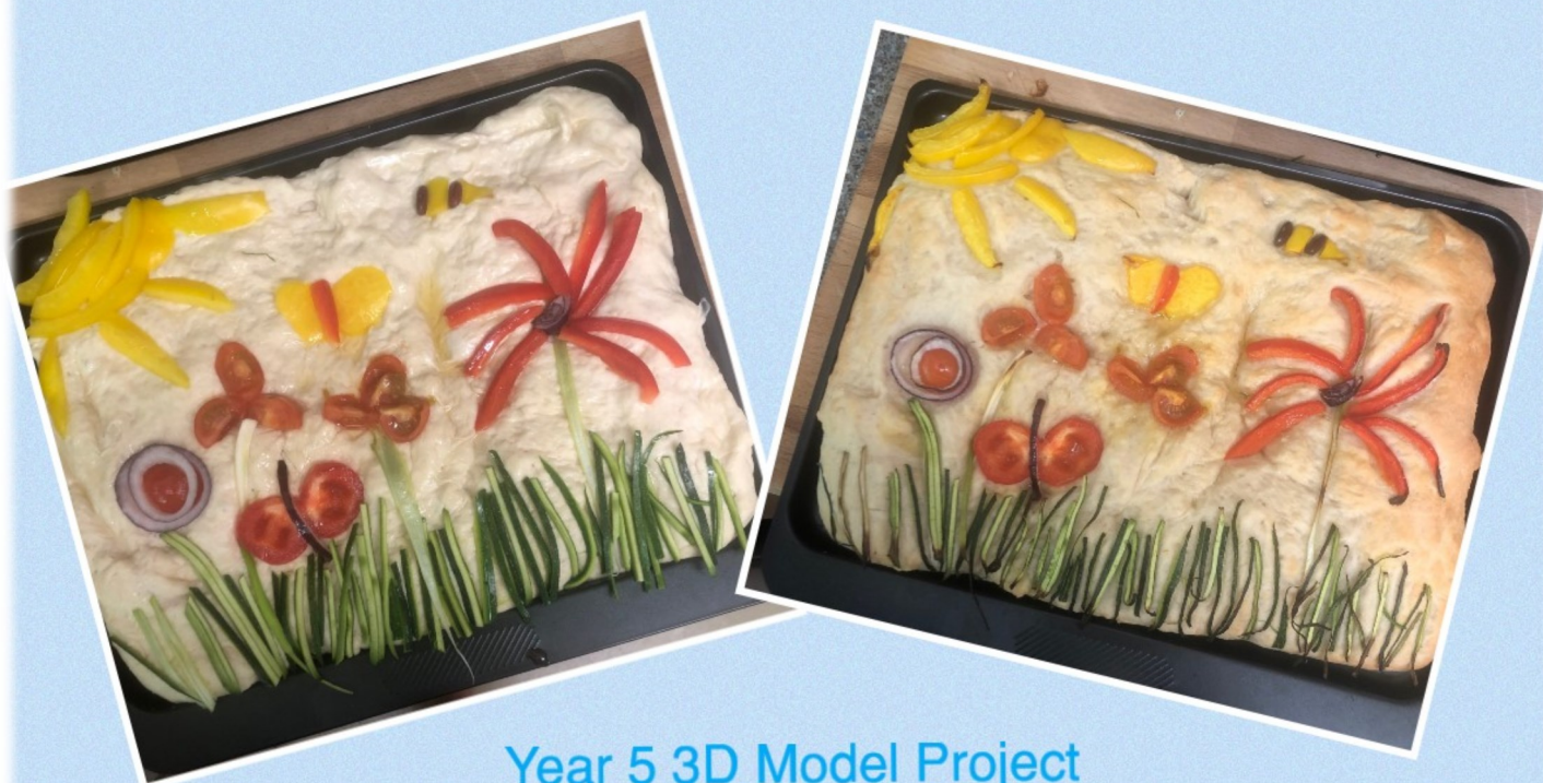
Year 5 3D Model Project - Bread Art